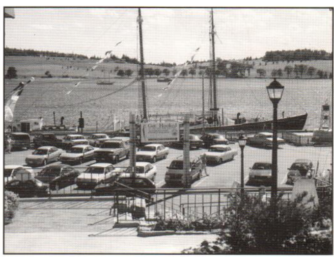
Looking across the harbor in Lunnenberg where we will have the Lobsterfest.