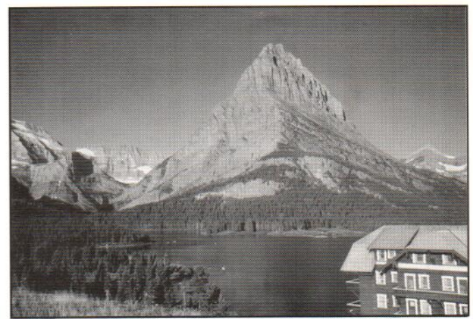
Majestic mountains project above the lake creating an inviting scene at the Many Hotel.