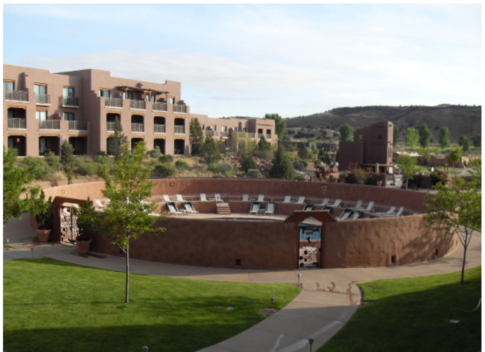
Hyatt Regency Tamaya, New Mexico