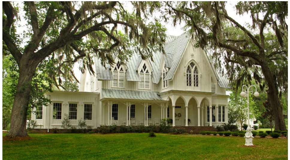
Rose Hill Mansion

Many of you are primarily focused on education and/or research. I can report to you from the front lines of private practice – it is a jungle out here. General dentists are frantically taking weekend courses in perio, endo, oral surgery, ortho, and pros to treat patients