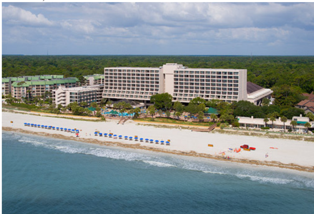
Hilton Head Marriott Resort & Spa, South Carolina