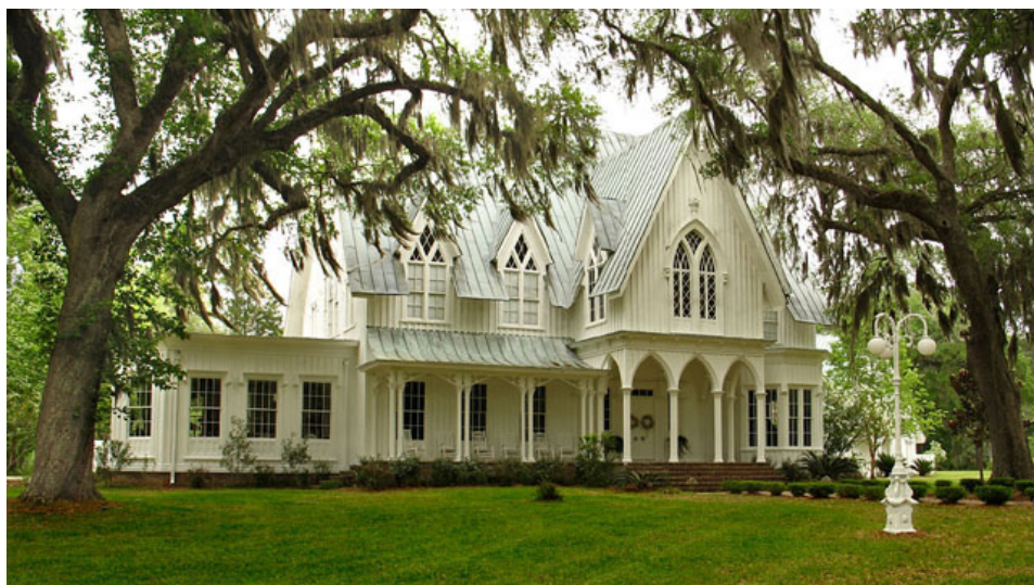
Rose Hill Mansion

As we left Hilton Head, we said our "goodbyes" until we meet again this May in Jackson Hole, Wyoming with the opportunity to extend our stay in nearby Grand Teton National Park, Yellowstone National Park, and the National Elk Refuge as a great incentive to attend the meeting. See you there!!!!